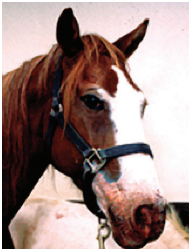
This mare has hepatic photosensitization characterized by erythema and necrosis involving only the white blaze on her face.

Hepatic photosensitization refers to abnormally heightened reactivity of the skin to ultraviolet sunlight, owing to the increased blood concentration of the photodynamic agent phylloerythrin. Phylloerythrin is normally formed in the gastrointestinal tract, as a result of bacterial degradation of chlorophyll. It is then absorbed into the general circulation, conjugated and excreted by the liver. During hepatic insufficiency, the blood concentrations of phylloerythrin are increased. Ultraviolet light is absorbed most efficiently in unpigmented areas; thus the lesions of photosensitization are restricted to white skin which first appears erythematous and edematous. Pruritus, pain, vesiculation, ulceration, necrosis and sloughing may ensue.