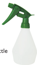
500 mL spray bottle

Spray applicators to treat the animal's environment/habitat to eliminate fungal spores and yeasts.