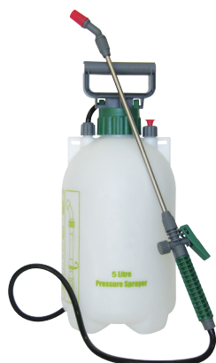
5 Lt pressure spray pack